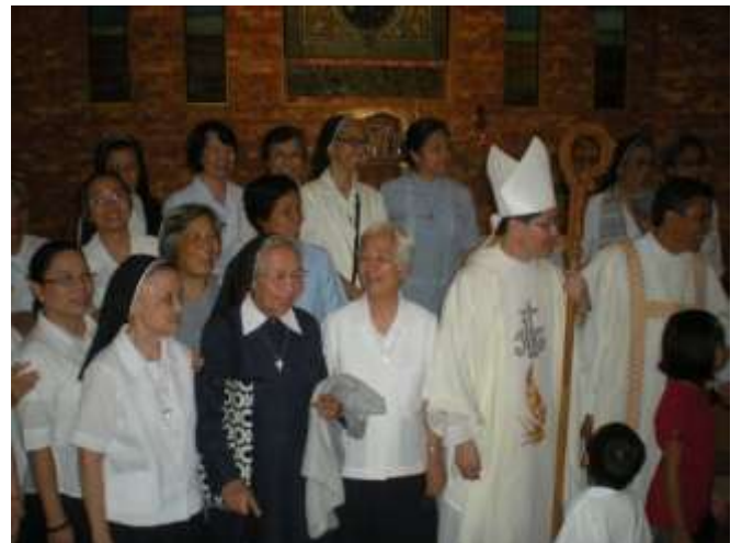
In all of the excitement after the ordination, Good Shepherd Sisters assemble for a picture with the Bishop and the newly ordained deacon.