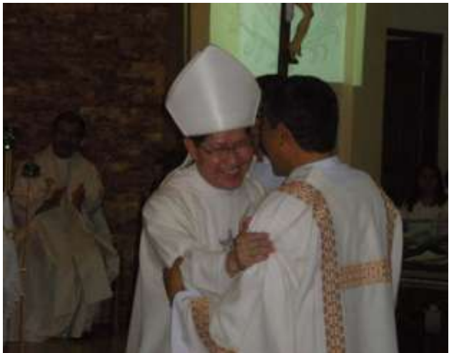
The Rite of Ordination concludes with the Bishop and other deacons offering a sign of peace to the newly ordained deacon.