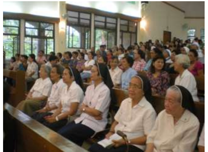
The Chapel of Bethlehem House of Prayer was full with over 200 people. Among those attending were Good Shepherd Sisters from Cavite, Batangas and Metro Manila.