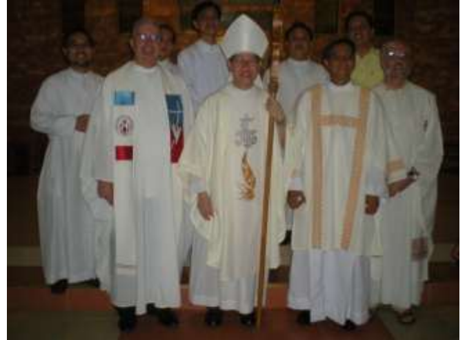
The Eudist community gathers for a picture with the Bishop and the newly ordained deacon.